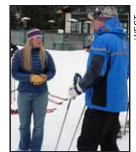
AT CRYSTAL MTN