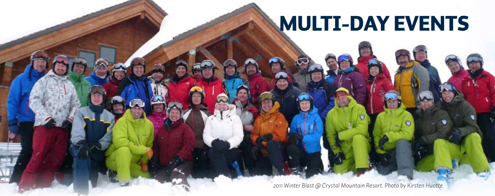
2011 Winter Blast @ Crystal Mountain Resort.