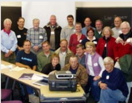
Senior Specialty group at Fall Seminar 2007